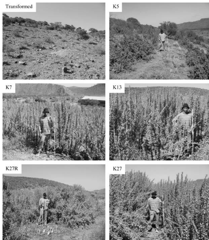
Figure 2. The Krompoort restoration blocks.

Krompoort lies in a broad valley, flanked by the Groot-Winterhoekberge mountain range to the south and the Klein-Winterhoekberge to the north. These ranges are made up of the Table Mountain Group of quartzitic sandstones of the Nardouw Subgroup and the Peninsula Formation. Bokkeveld shales, sandstones, and siltstones of the Ceres and Traka Subgroups are the dominant underlying geology at Krompoort. The parent material of any particular soil profile on Krompoort is likely to be a mixture of transported material and weathered bedrock. The underlying geology of the P. afra restoration site on the Kudu Reserve is Beaufort Group shale of the Adelaide Formation on the upper slopes and Ecca Group shale of